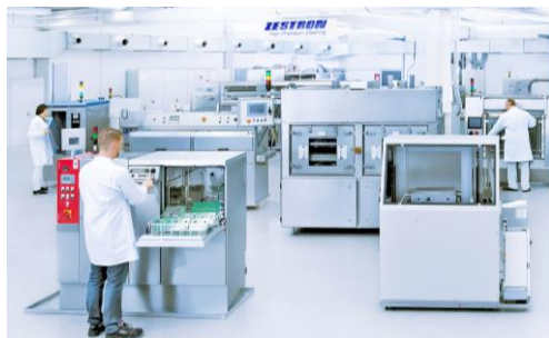
Machine Test Center